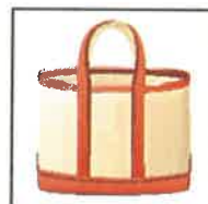
Over-sized Tote Bag