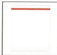
1-Gallon Plastic Freezer Bag