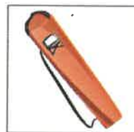
Folding Chair Bag (Folding Chair is Allowed)

FOR MORE INFORMATION GO TO PGATOUR.COM/ProhibitedItems