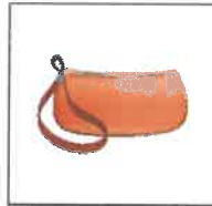
Bags smaller than 6" x 6" x 6"