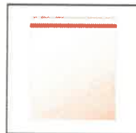
Tinted Plastic Bag