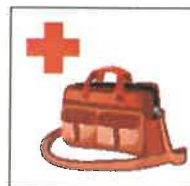
Medically Necessary and Diaper Bags*

*Infant and Medical supplies will be permitted after proper inspection.