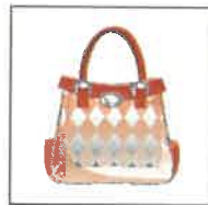
Printed Pattern Plastic Bag